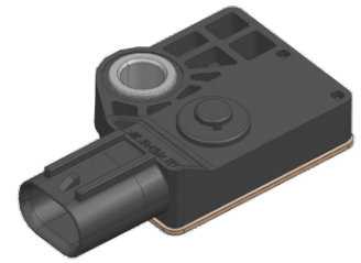
External ANC Sensors

Molex External ANC Sensors, which are phantom-powered slave units employing differential pairs, convert airborne noise into digital electrical signals that generate a cancellation soundwave to reduce unwanted noise within the vehicle passenger compartment