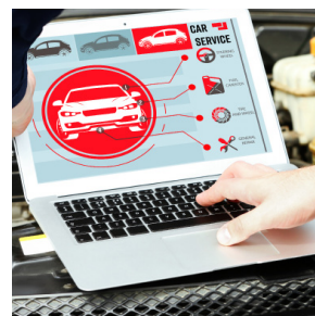
Mechanic Laptop Engine