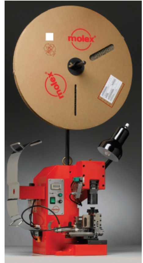
TM-3000 Universal Press with a Molex air-feed applicator that processes product on Mylar tape

Safety interlock switch is attached to guard preventing press from cycling if guard is open during operation