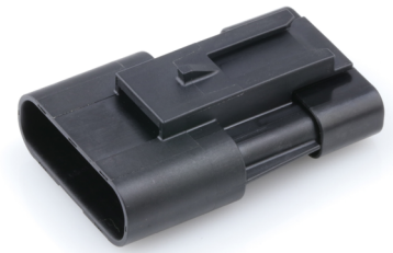
Squba Sealed 1.80mm-Pitch Panel Mount Connectors

Squba Sealed 1.80mm-Pitch Panel Mount Connectors attach directly to the panel to eliminate external strain. They offer a UL-approved, IP68-seal rating and carry up to 6.0A of current—delivering rugged and reliable power for space-constrained applications.