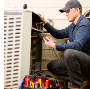
Consumer and HVAC