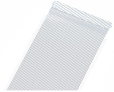
Premo-Flex FS19 0.50mm-Pitch Jumper Cable with Ear Tabs