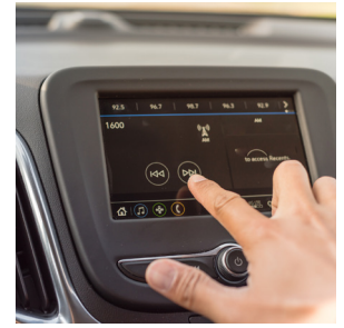
Display Audio Equipment