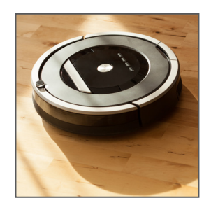
Robotic Floor Vacuum