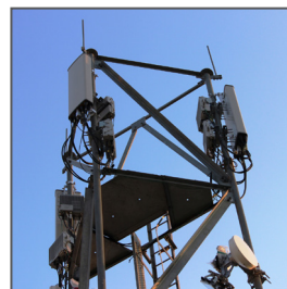
Remote Radio Head