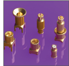
SMP-MAX 50 Ohm Board-to-Board Connectors