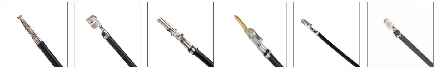
Mega-Fit MicroClasp Micro-Fit 3.0 Micro-Fit Plus Micro-Lock Plus Micro-One