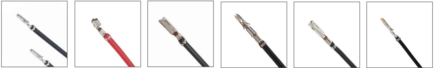
Mini-Fit Versa Color Mini-SPOX Mizu-P25 MLX MX150 Nano-Fit