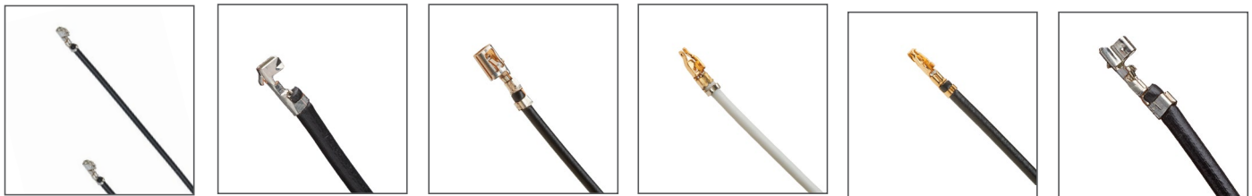
OneBlade PicoBlade Pico-Clasp Pico-EZmate Pico-Lock Pico-SPOX