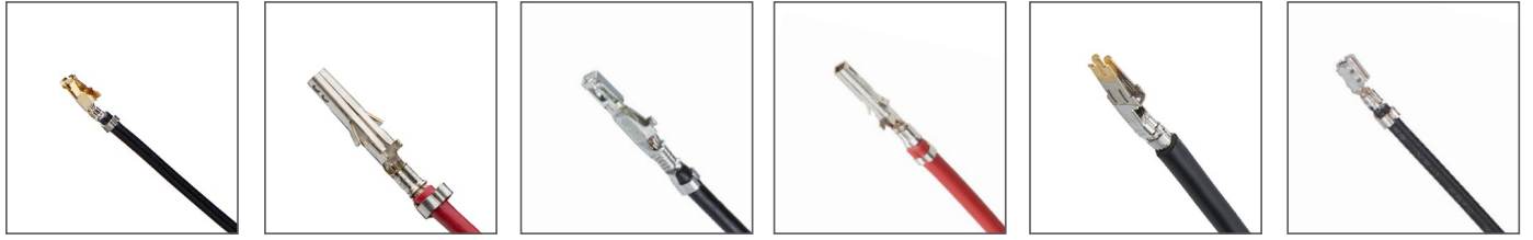
Milli-Grid Mini-Fit Mini-Fit Max Mini-Fit Sigma Mini-Fit Sr. Mini-Lock