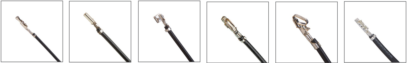
C-Grid III CLIK-Mate DuraClik iGrid KK KK Plus

Molex's range of pre-crimped leads offers a simple, cost-effective solution for prototyping, pre-production and mass production requirements. These leads are offered in female-to-female and male-to-male configurations in lengths of 75.00 to 600.00mm.