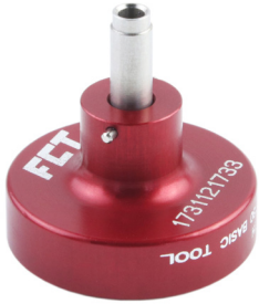
Positioner for D-Subs and High-Density Contacts*

A highly reliable crimp connection is the result of using high-quality crimping tools. Molex's crimping tools, with an 8-impession crimp, help to ensure maximum tensile strength with most closed-barrel contacts. This FCT product line series is available for all common turned contacts.