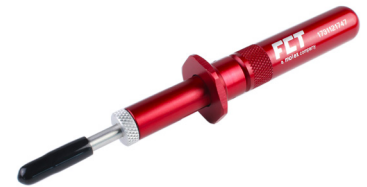
Extraction Tool for Contacts