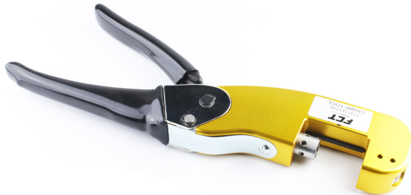
Crimp Tool for RF Contacts