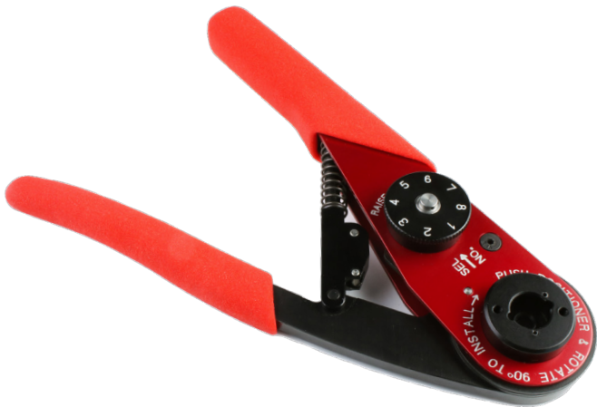
Crimp Tool for D-Subs and High-Density Contacts