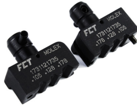
Crimp Dies for Coaxial Contacts