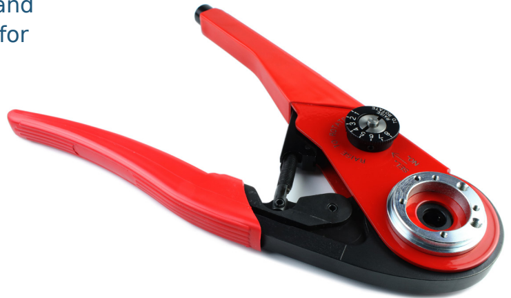
Crimp Tool for High-Power Contacts

Molex Crimping Tools provide excellent performance for reliable electrical connections. These tools are available for high-quality, turned contacts from our D-Sub products and offer the appropriate positioners and dies for various cable cross-sections