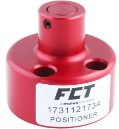
Positioner for High-Power Contacts*