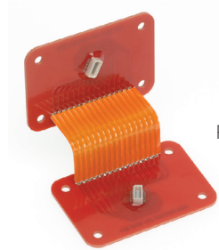
Custom RFC with Round-Flat-Round Contacts

RFC designs are available with polyester, aramid and polyimid insulation options. Hot Bar Solder Cable Jumpers are an additional alternative solution to cable jumpers and do not require a connector. They are permanently affixed to the PCBs through direct soldering. Premo-Flex RFC and Hot Bar Solder Cable Jumper designs meet Registration, Evaluation, Authorization and Restriction of Chemicals (REACH) requirements.