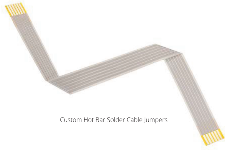
Custom Hot Bar Solder Cable Jumpers

www.molex.com/product/premoflex_ffc-fpc.html